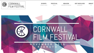
Cornwall Film Festival creates film events, special screenings and produces an education programme annually